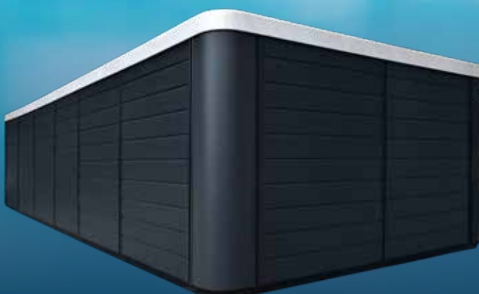
Slate Grey Cabinet